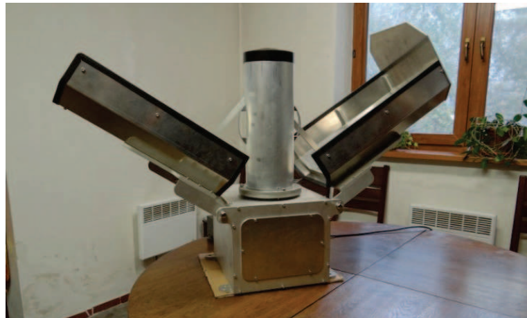
Fig. 1: Telescope in open configuration

Abstract: The paper deals with advanced approach for aeroelastic assessment of slender full sky telescope (see Fig. 1) for astronomical observation of the star-sky [1]. The telescope will be positioned outside in high geographical locations with dominant action of the wind. Functional requirements in such locations have resulted in a daring structural design of the telescope. The reliability of such device cannot be estimated unless ultimate aeroelastic response is considered. Telescope is equipped with two side sheets which can be opened in order to allow the full view function. The telescope is subjected to tuned vibration control in order to face extreme wind velocities in territories of its application for the case with open side sheets. The main question to be answered was the value of maximal wind velocity allowable for the case with slightly or full open size sheets. The measurements were made on actual telescope in the wind canal. The wind velocity varied in scope from 0 until 52 m/sec. Measured were the influences of laminar air flow, with consideration of turbulences in the boundary layer in proximity of the experimental set-up (see Fig. 2).