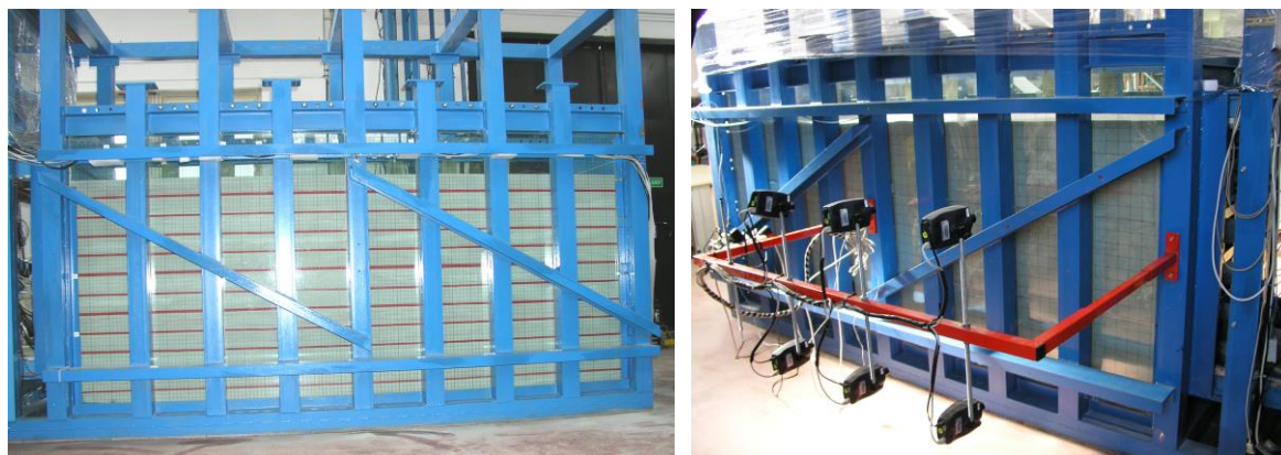
Fig. 1: Experimental equipment and the sample before experiment E5/0,1 prepared. a) Right transparent glass side and the sample with red strips on Febr. 28, 2012 (left). Moved front wall is left. b) Left transparent glass side and the sample with little black balls and camera system registering ball locations on March 20, 2012 (right). Moved front wall is right.

the pressure sensors, temperature sensor and analog potentiometric sensors are conditioned, amplified and led to 16bit A/D convertors, then via interfacing USB devices (BMCM) into the measuring computer. Two digital displacement sensors (resolution 10 nm) and two potentiometric sensors, located on upper and lower wall part next to wall axis, are connected into the PC via internal card. The second computer is used for controlling of a camera system.