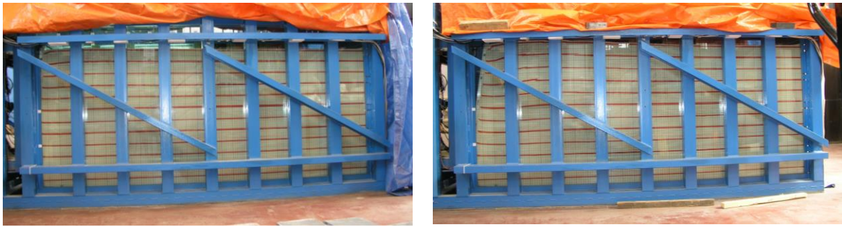
Fig. 2: Views on deformation of the sample (especially of front part left) according to the red strips after front wall rotation about the toe. The moved wall is left and the back solid wall is right. a) Deformation of the sample after top movement of 66.33 mm without any slip surface (in detail see Fig. 3a). b) Deformation of the sample after the final top movement of 152.00 mm with four slip surfaces in sample front part into depth of about 0.3 m (in detail see Fig. 3b).