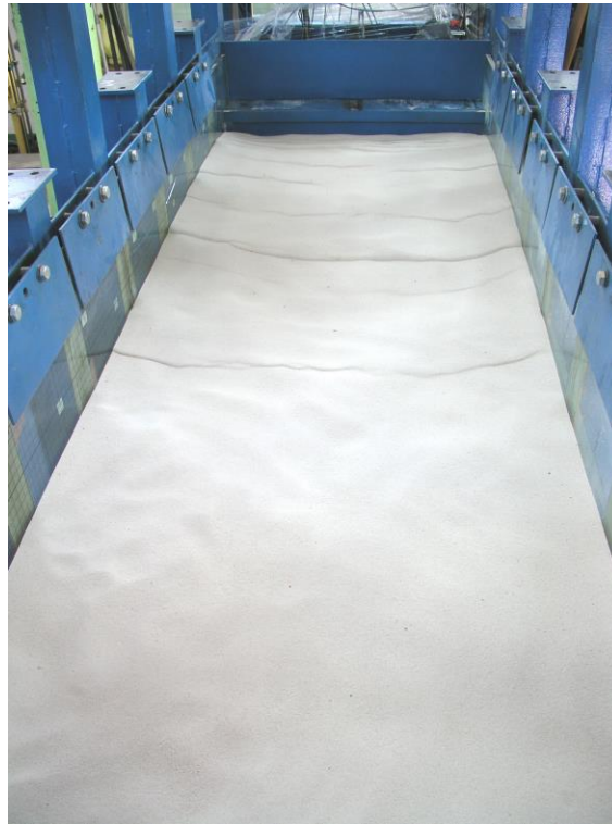
Fig. 4: View from above over the solid back wall on upper sample surface after the final maximal top movement of 152.00 mm. The slip surface openings can be seen nearly to the moved front wall (above).

The maximal final top movement was reached of 152.00 mm. An actual uplift of the red strips and four visible slip surfaces can be seen in Fig. 2b and in detail according measured data in Fig. 3b. Not all slip surfaces crosscut through adjacent strip: two slip surfaces nearer to the moved wall were continuous but the other surfaces (farer from the wall) were not continuous what is obvious in Fig. 3b. The surface did not get deep into the sample, e.g. the first two surfaces got in a depth of 0.2 m, the deepest single strip failure was registered in depth of 0.4 m. Sample surface openings are obvious in Fig. 4.