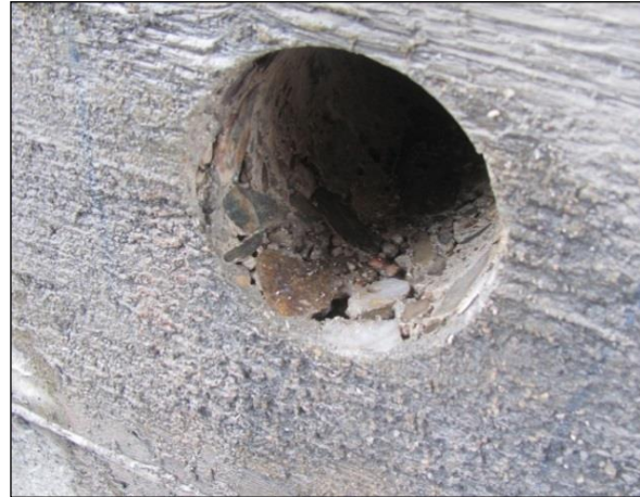
Fig. 4: Detail of the drillhole – patchy concrete.