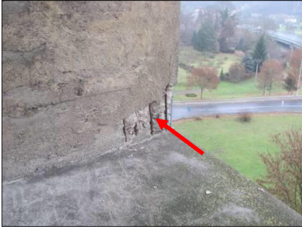
Fig. 3: Deep corrosion of the reinforcement.

deteriorated only superficially in very thin layer. Abutments are damaged more than columns in connection with more extensive accumulation of water behind the reverse side and also due to impact of roots of spreading vegetation including woods. Concrete parts of columns and abutments are damaged similarly to the main vault arches.