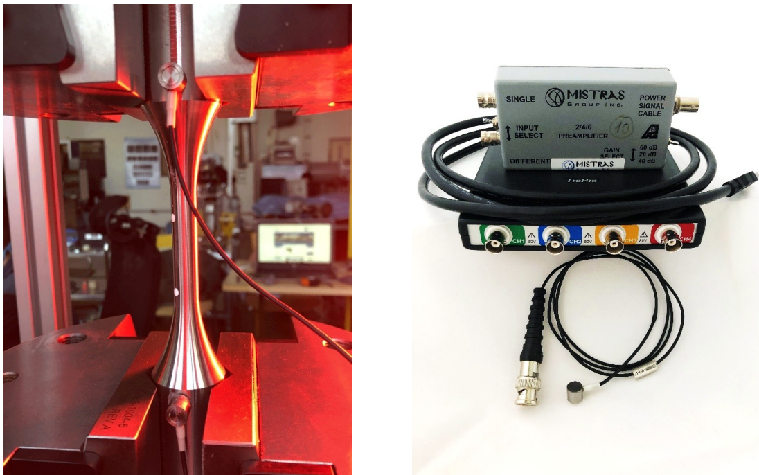
Fig. 1: Specimen in testing machine, USB oscilloscope, AE preamp and sensor.

The specimens were loaded on axial-torsional testing system of Instron 8852 type. The testing system consists of a universal hydraulic testing machine, hydraulic power unit, control unit, and personal computer. The system has an axial load capacity of \pm 100 kN. The testing procedure was designed in the proprietary software Bluehill Universal by Instron company. Strains were measured by AVE-2 Non-Contacting Video Extensometer also supplied by the Instron company. To dampen the noise of the hydraulic system of the testing machine, special polyamide thin plates were used to acoustically separate the wedge grips from the machine frame. Concerning AE equipment, two piezoelectric sensors (Dakel IDK-9) were glued to the surface of the material to measure elastic waves and convert them into electrical signals. The signal path also contained preamplifiers (PAC 2/4/6) to suppress interference. Finally, a USB oscilloscope (TiePie Handyscope HS6) was used for continuous recording of the emission signal (see Fig. 1).